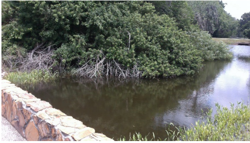
27) 15 th south tee from bridge Remove low hanging tree limbs $ 2,590.00 for both pictures