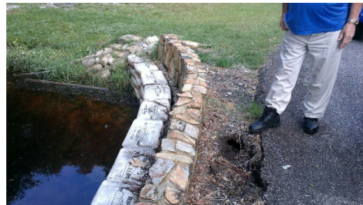
30) Bridge at 4 green-repair leaning wall and hole forming along cartpath. The wall behind the rip-rap is leaning, leaving a void between the two where rainfall can get between the wall and rip-rap causing erosion. The hole along the edge of the cartpath is weakening the structural integrity of the path. $ 42,000.00