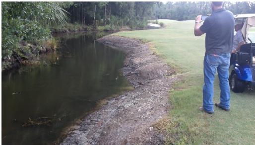
29) Channel on 3 north-repair creek bank Bermudagrass killed off by course personnel. The Association previously seeded the bank and installed geo-textile fabric to hasten the seeding. Erosion will now cause sediment to spill into the creek until the bank is again stabilized. $ 9,500.00