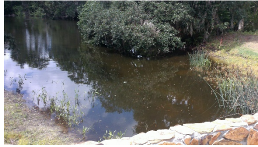
28) 15 th south tee from bridge