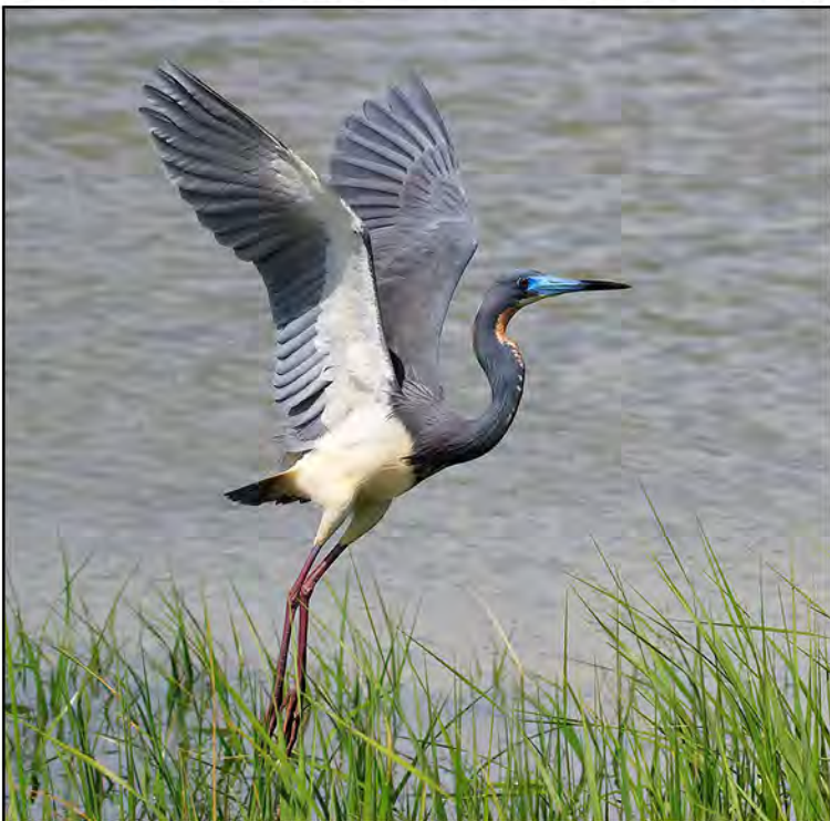
Tricolored Heron blast-off