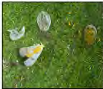
White fly and larvae

Consider growing some vegetables in containers. Since gardening in Florida is different, the University of Florida is the best source for information. Access these two publications on the Internet; "Minigardening (Gardening in Containers)" at http://ufdc.ufl.edu/IR00005428/00001 and the "Florida Vegetable Gardening Guide" at: http://edis.ifas.ufl.edu/vh021 which lists the vegetable varieties appropriate for planting here along with the planting dates. Vegetable Gardening in Florida by James Stephens is the best book to purchase for gardening information. It is a great resource that also contains excellent pictures of insect pests and diseases of vegetables.