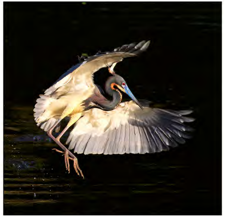
Tricolored Heron at dusk