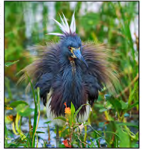
Tricolored Heron in breeding plumage

Please see my favorite photographs at: www.flickr.com/jake_jacoby