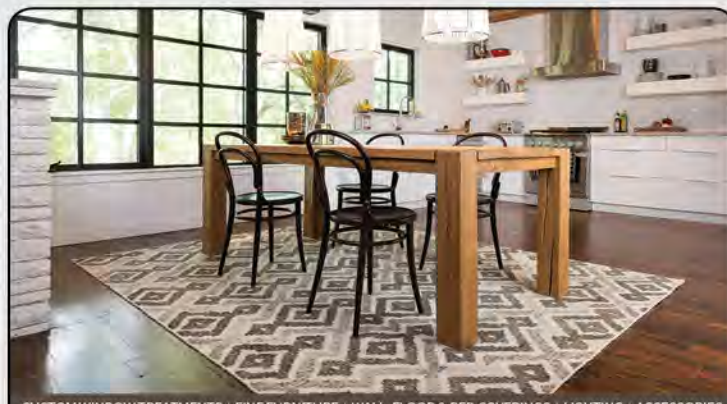
CUSTOM WINDOW TREATMENTS | FINE FURNITURE | WALL, FLOOR & BED COVERINGS | LIGHTING | ACCESSORIES

While it may come across as a simple piece of decor, choosing the perfect area rug can be an intimidating venture. If you need help finding one that fits your space, get in touch Decorating Den Interiors. She will come to your home for a consultation to evaluate the room's size, style and atmosphere to provide area rug recommendations.