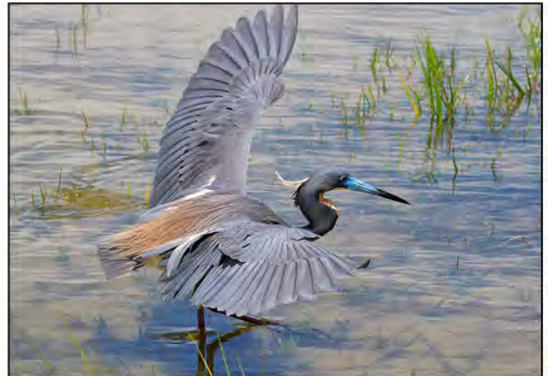
Tricolored Heron fishing