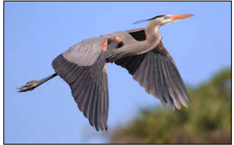
Great Blue Heron in flight

I took all of these photographs in the Tampabay area this year. Please see my favorite photographs at www.flickr.com/jake_jacoby