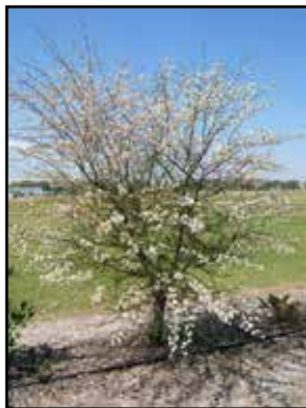
Chickasaw plum in flower