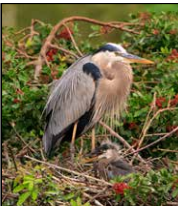
Great Blue Heron with chick