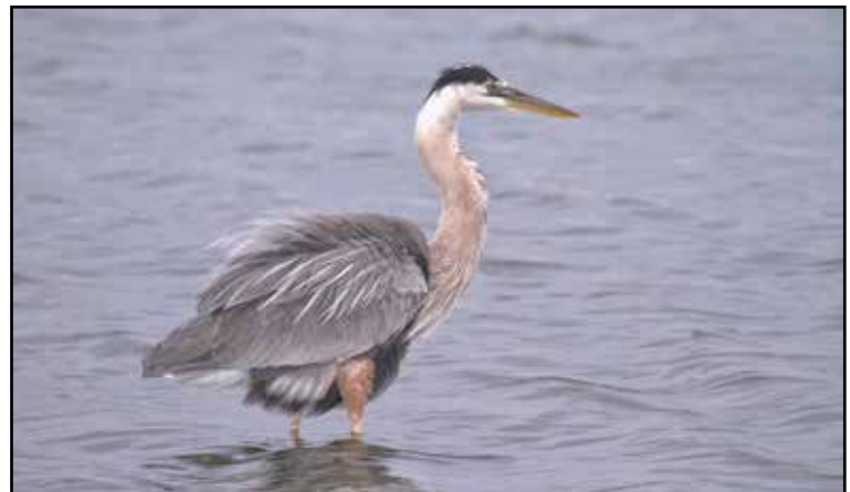
Searching for sushi