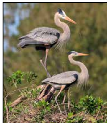
Great Blue Herons on the nest