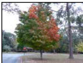
Florida maple fall color