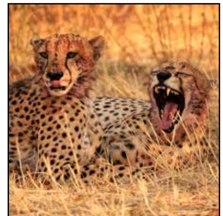
Cheetahs at rest

All of the above photographs were taken by me in September 2017 in the Kalahari Desert region of South Africa.