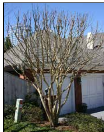
Correct crape myrtle pruning

WINTER FLOWERS: Remove spent blooms and leggy growth from plants and fertilize with slow release fertilizer to coax a few more weeks of blooms from these flowers.