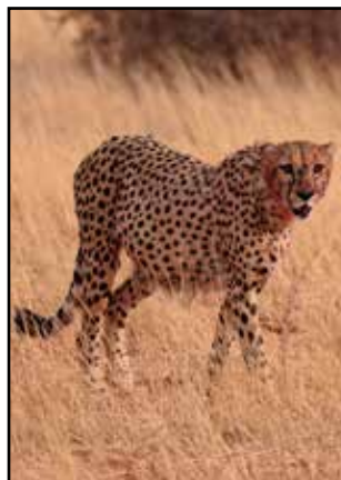
Cheetah on the hunt