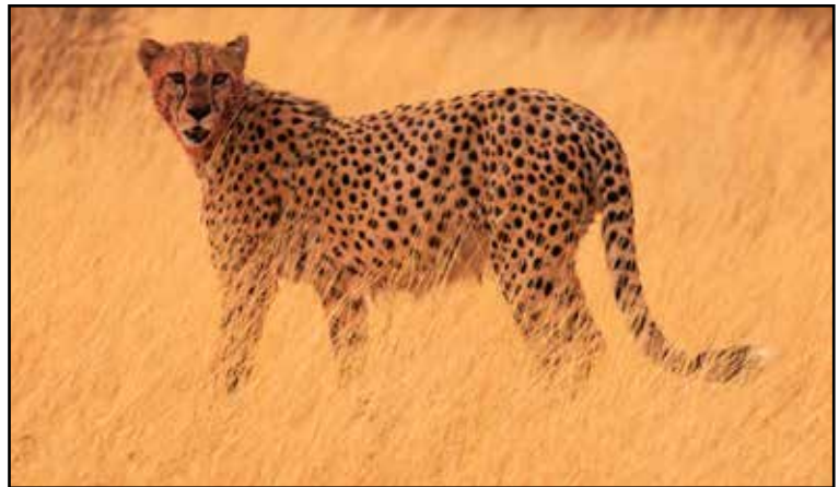
Cheetah in the grasslands