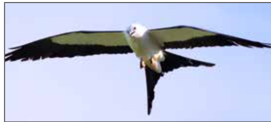
Captured Prey in the Talons

without pausing. They also drink on the wing like a swallow, swooping low to snatch water from the surface of a river, lake or pond.