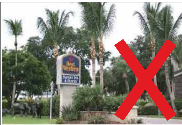
Hurricane pruned palms

Be cautious with the pruning of large shade trees. The common malpractice of removing many or all interior low branches is considered over-thinning or “lions-tailing”. Dr. Gilman states that “When people prune trees in this abusive manner, excessive live tissue is removed from the tree and no structural pruning is performed. This creates poor form and numerous wounds, and the tree becomes more prone to failure especially if there are few trees nearby. Old trees can decline as a result of removing too much of the leaf canopy. The best practice is to remove no more than ten percent of the live foliage on mature trees.”