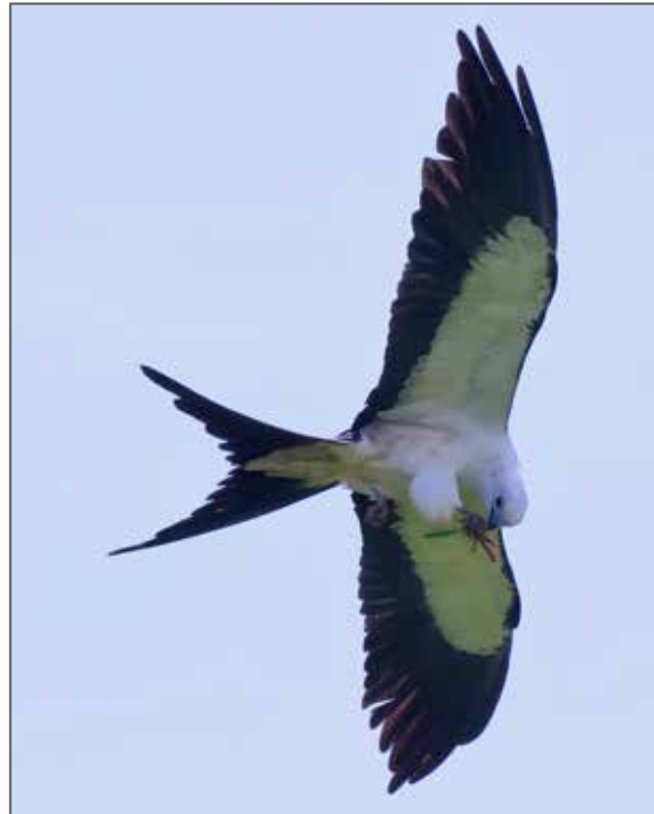
Eating on the Fly