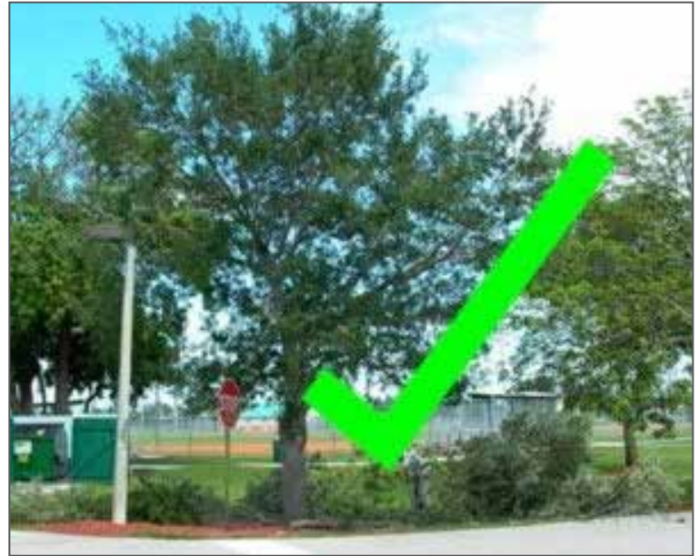
Oak with properly trimmed canopy

Reducing the amount of foliage on the ends of the branches, and thus the weight, is a better practice to reduce risk of branch and tree failure during high winds. The canopy can be opened up without removing all of the interior branches and attached foliage. An arborist certified by the International Society for Arboriculture is trained in the proper way to prune and protect trees. However, all certified arborists are not equal. When requesting a quote from an arborist, ask to see their ISA certification card, proof of liability insurance (ask for this no matter who you hire), references, and also ask if they will be with their crew when the work is done. You might even go to look at some trees that they have pruned. You can find certified arborists in our area on the Internet at: https://www.treesaregood.org/findanarborist/arboristsearch For University of Florida information on tree pruning on the Internet, see Pruning Landscape Trees and Shrubs at: http://hort.ifas.ufl.edu/woody/pruning.shtml If you plan to plant new trees, you can find information on selection in another UF publication: Selecting Southeastern Coastal Plain Tree Species for Wind Resistance: http://edis.ifas.ufl.edu/pdf/FR/FR17400.pdf